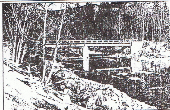
REPAIRS TO BE MADE FOR BRIDGE (PRIVATE) NEWS Photo by Herb O'Brien Finishing touches have been applied to a Carabassett River bridge after the old bridge washed away in April's flood (1987)